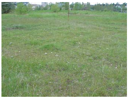
Figure 1 : Typcial mulched (left) and herbicide-treated (right) plots one year after installation; note the rows of mulched snowberry on the left, obscured by weeds on the right