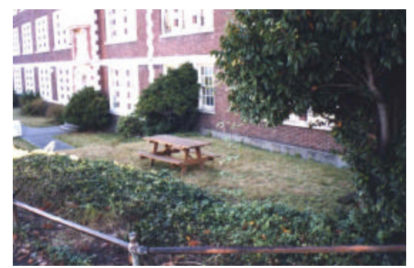
Figure 1: Area A, looking NE at the upper lawn area