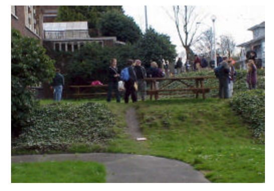
Figure 2: Area A, looking S from the lower lawn towards the upper lawn

Area B is small site with a relatively steep slope; it covers the area between the greenhouse and the road and is confined by the wall and the driveway. It is covered with ivy, dead plants, and debris and has two large lily-of-the-valley bushes on each edge. The dead and trampled plants in this area indicate the site is heavily used. There is a small flight of concrete steps running up the middle of this area, which is not used since the greenhouse is fenced off (Fig. 3). This area receives afternoon sun.