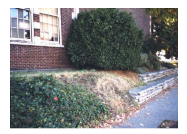
Figure 3 (left): Area B, looking S toward the stairs; Figure 4 (right): Area C, looking S toward the Peace Garden